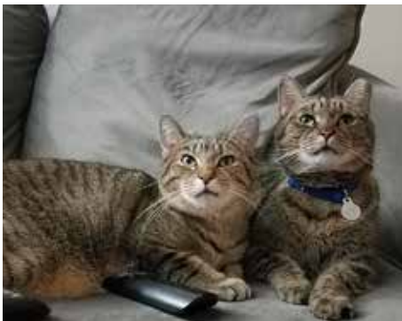
Cyra & Tanner

It's been almost five years since we adopted our shy cat room kitties, and they are doing great! Gomez is one of the snuggliest cats I've ever known (he even head butts and snuggles our two dogs), and Annie is a daddy's girl who enjoys belly rubs and wet food.