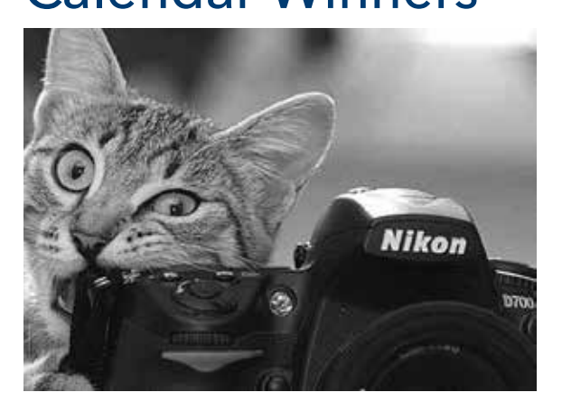
Our 2020 calendar contest winners will be announced online at catwelfareassoc.org on August 15.