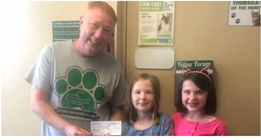
Thank you to Grace and Hope for generously donating the funds you raised from your lemonade stand! We are so grateful to all of the kids who are raising funds and hosting supply drives for the cats and kittens in our care.