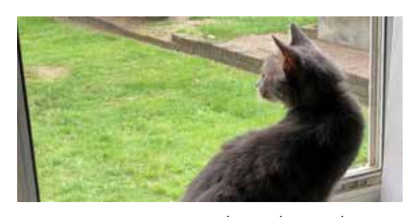
Dusty is a sweetie. She adapted quickly to her new home and purrs up a storm.