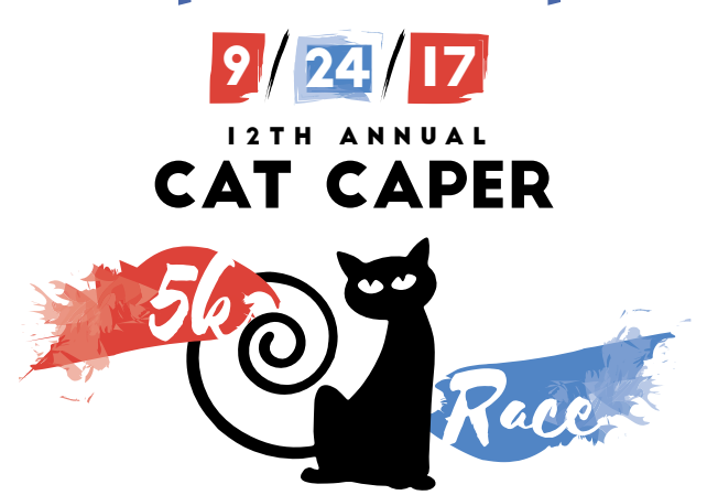
TO BENEFIT CAT WELFARE ASSOCIATION

Are you ready to run, race-walk or stroll at scenic Griggs Reservoir to benefit our mission? Our 12th annual Cat Caper 5K will be held Sunday, September 24. Our 2016 participants raved about the new venue!