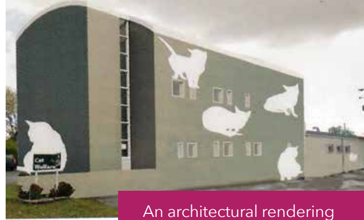
An architectural rendering of the expanded shelter.